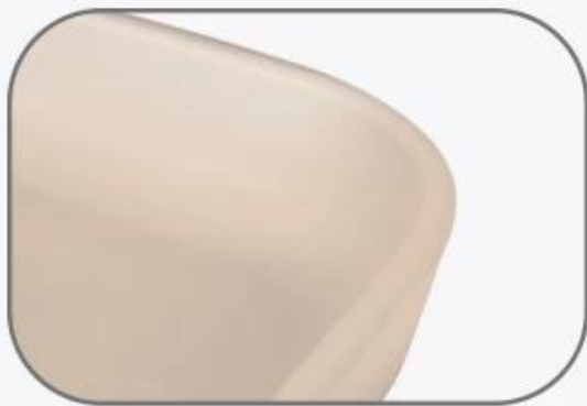
Fillet treatment Do not cut hands