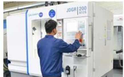
CNC milling machine