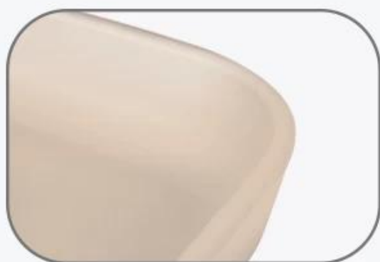
Fillet treatment Do not cut hands