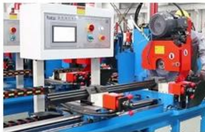
Full automatic pipe cutting machine