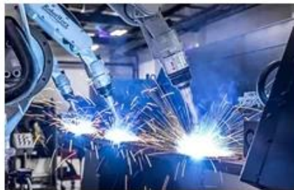
Welding robots automatically weld various metal parts