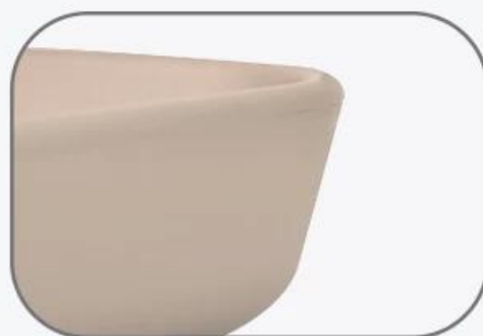
Side elevation treatment