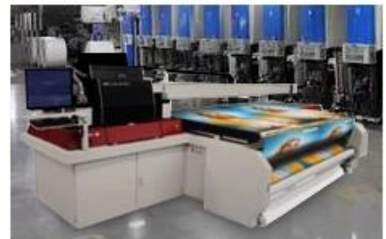
UV inkjet printer