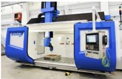
CNC machine tools process various metal parts