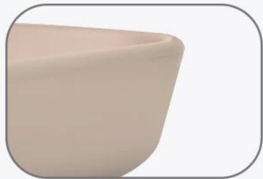
Side elevation treatment