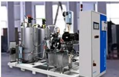
Klaus Maffei high-pressure PU perfusion machine imported from Germany