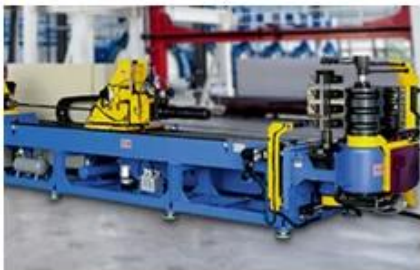
Fully automatic CNC pipe bender