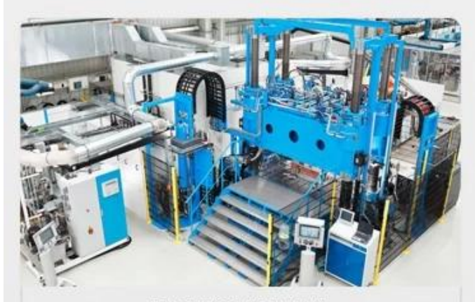
KRAUSS MAFFEI High Pressure Reaction Injection Molding (RIM) Machine from Germany