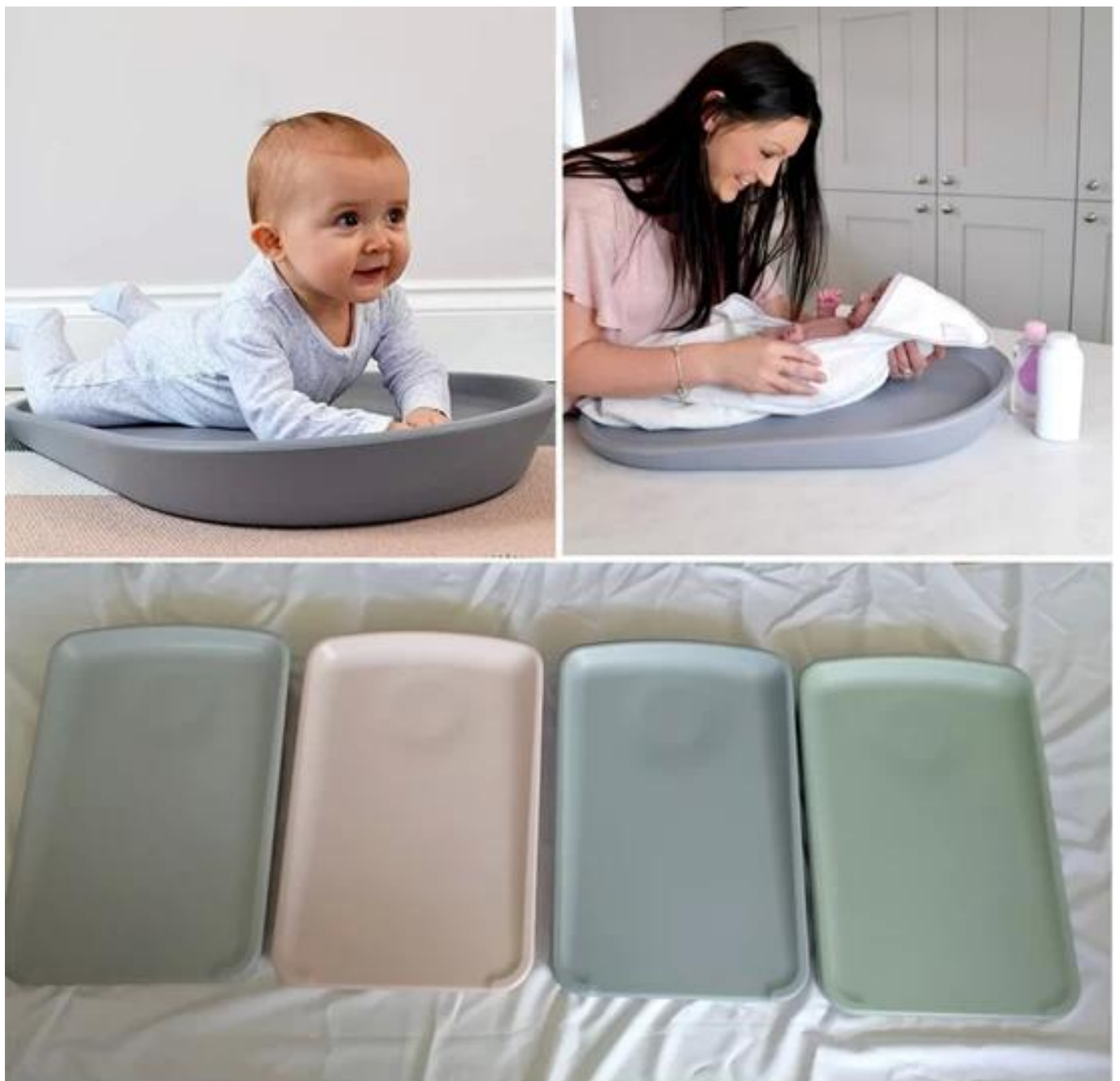
Factory customize high density baby diaper changing mat for baby