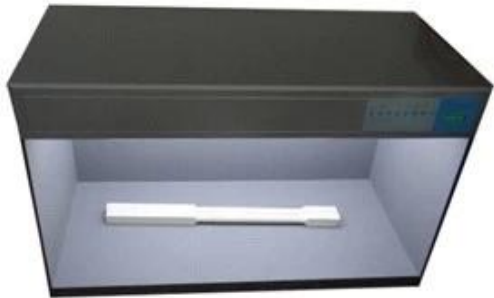
Standard Color compare Lighter box