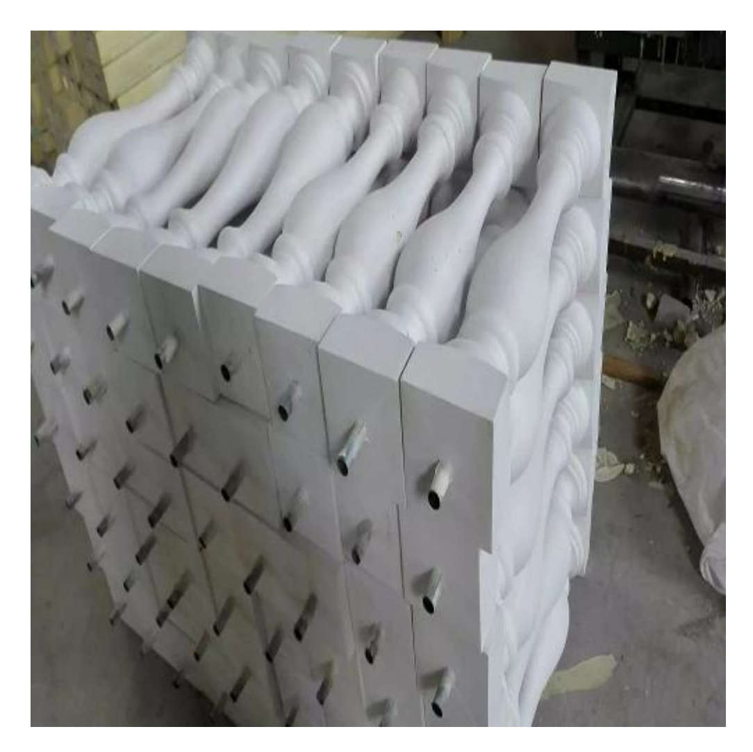
A Breif Introduction About Our Company