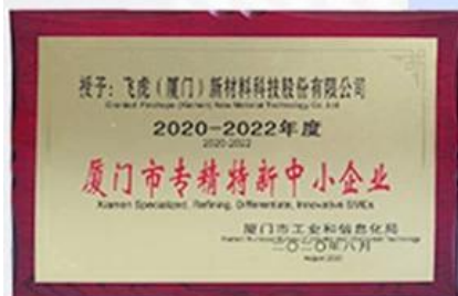
Xiamen Specialized, Refining, Differentiate, Innovative SMEs

Pollution discharge permits are the "identity cards" of all entities involved in the discharge of pollutants and are issued by the Xiamen Municipal Environmental Protection Bureau. General Secretary Xi Jinping emphasized that "the ecological environment should be protected like the eyes, and the ecological environment should be treated like life." Premier Li Keqiang said: "Environmental pollution is a hazard to the people's livelihood and the pain of the people's hearts. It must be dealt with an iron fist." The Chinese government's determination to improve the environmental quality of the atmosphere, water bodies, and soil cannot be ignored. Pollution permits are an important factor that must be considered in international procurement. Otherwise, the factory has hidden dangers and will be ordered to stop production, which will affect the delivery date. It can be seen that Finehope is a manufacturer with long-term cooperation and stable delivery.