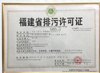
Fujian Province Pollution Discharge Permit

Pollution discharge permits are the "identity cards" of all entities involved in the discharge of pollutants and are issued by the Xiamen Municipal Environmental Protection Bureau. General Secretary Xi Jinping emphasized that "the ecological environment should be protected like the eyes, and the ecological environment should be treated like life." Premier Li Keqiang said: "Environmental pollution is a hazard to the people's livelihood and the pain of the people's hearts. It must be dealt with an iron fist." The Chinese government's determination to improve the environmental quality of the atmosphere, water bodies, and soil cannot be ignored. Pollution permits are an important factor that must be considered in international procurement. Otherwise, the factory has hidden dangers and will be ordered to stop production, which will affect the delivery date. It can be seen that Finehope is a manufacturer with long-term cooperation and stable delivery.