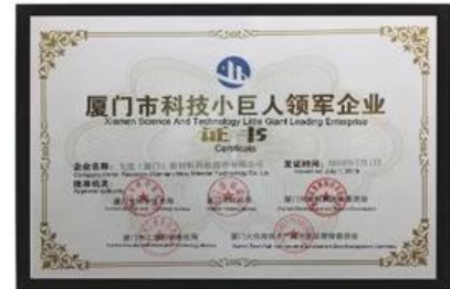
Xiamen Science and Technology Little Giant Leading Enterprise