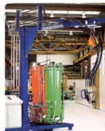
• PU Foaming Equipment PU(聚氨酯) 发泡设备