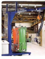
• PU Foaming Equipment PU(聚氨酯)发泡设备