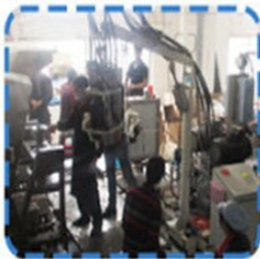
Lean production lines on 4th Floor