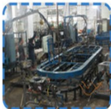
Cap & base sets production lines on the 1st Floor