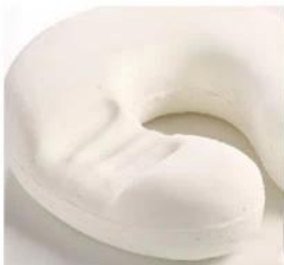
Details of springback