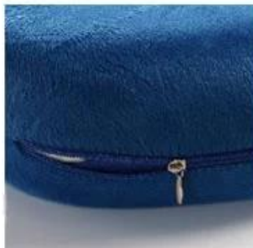
Details of zipper