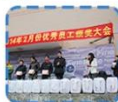
Excellent employee Award Presentation Ceremony