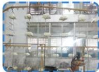
Painting production lines on the 1st Floor