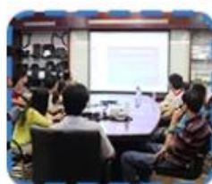
Xiamen University training course