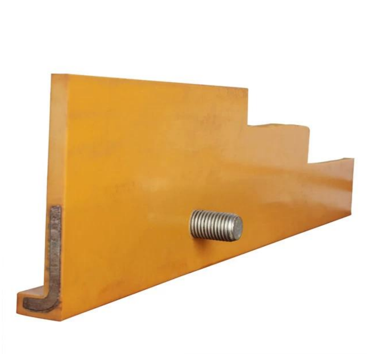
China fábrica personaliza peças de rolo de espuma de poliuretano para veículo de engenharia