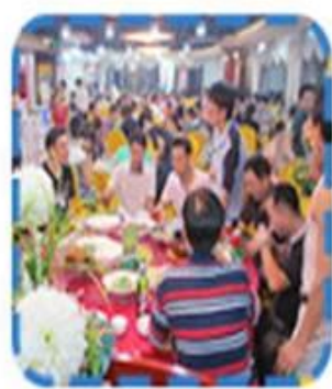
The Mid Autumn Festival