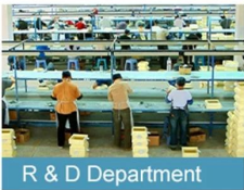
R & D Department