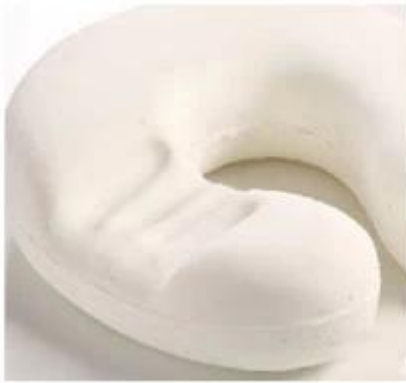
Details of springback