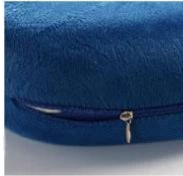
Details of zipper